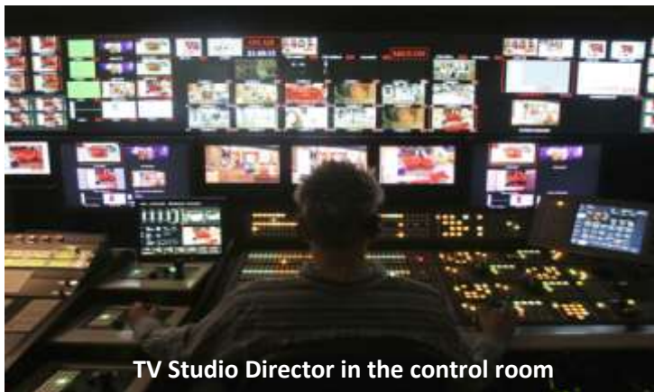
TV Studio Director in the control room